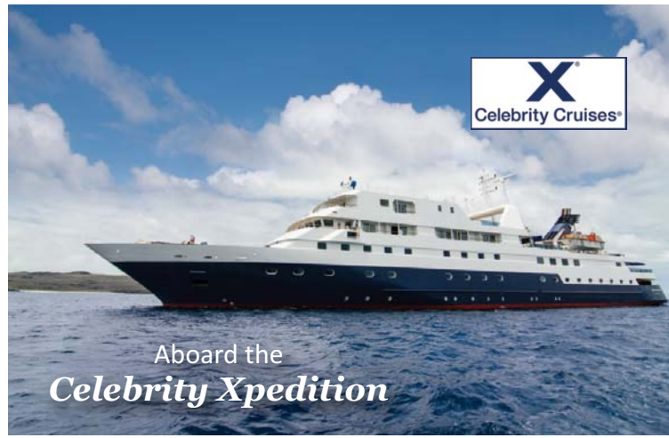
Aboard the Celebrity Xpedition