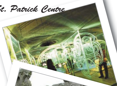
St. Patrick Centre

Today you will enjoy the beautiful scenery of Wicklow County, known as the 'Garden County' of Ireland. You will stop in Glendalough where St. Kevin founded a monastery in the 6th century. From this beginning, the site grew to become famous as a center of learning throughout Europe. See the Rock of Cashel, the traditional seat of Irish kings. Here St. Patrick is thought to have converted the King of Munster. The present ruins are from structures built in the 12th and 13th centuries, during the Norman era. Dinner and overnight in Cork.