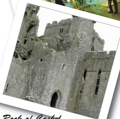
Rock of Cashel